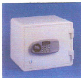
LOCKTECH Buffalo EM020

External 360 x 424 x 388 Internal 245 x 325 x 260