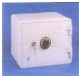
LOCKTECH Combo SM020

External 360 x 424 x 388 Internal 245 x 325 x 260