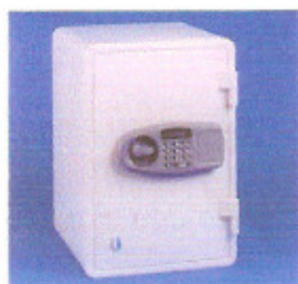
LOCKTECH Jumbo ES030

External 440 x 344 x 388 Internal 325 x 245 x 260