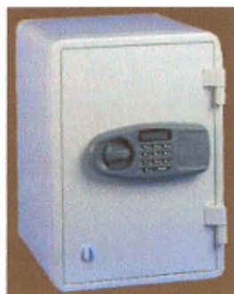
LOCKTECH Jumbo X ES031D

External 535 H x 410 W x 445 D Internal 415 H x 305 W x 320 D