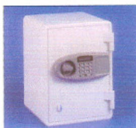
LOCKTECH Rhino EM016

External 390 x 296 x 320 Internal 310 x 215 x 215